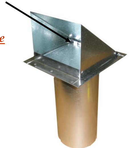
GALVANIZED WALL VENT