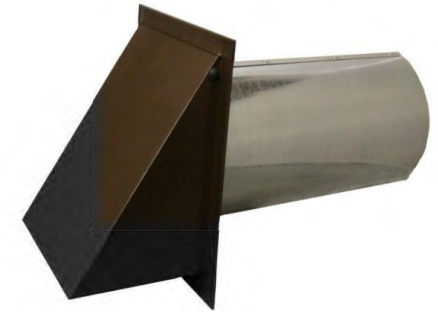
BROWN SIZES: 3"- 14"