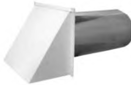
WHITE SIZES: 3"- 14"