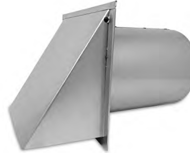
STAINLESS STEEL SIZES: 3" - 10"