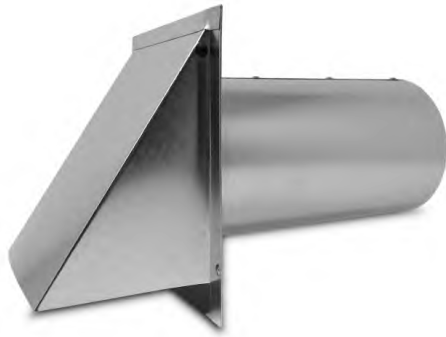
GALVANIZED SIZES: 3" - 14"