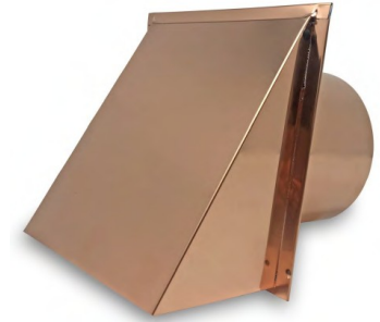
COPPER SIZES: 3" - 10"